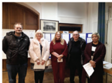
Become a Councillor Event.